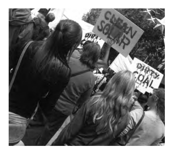
Figure 4.2 Walk Against Warming march. World Vision Get Connected, Issue 7

Figure 4.2 is a dynamic, narrative image where the image-maker has made different choices to build the relationship between the viewer and the image. Look at the image and answer the questions.